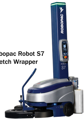
Robopac Robot S7 Stretch Wrapper