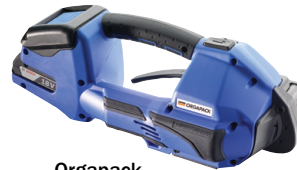
Orgapack OR-T 260

Ask our team of experts to help you take advantage of technology that will accelerate your operations and boost profitability.