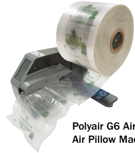
Polyair G6 AirSpace Air Pillow Machine