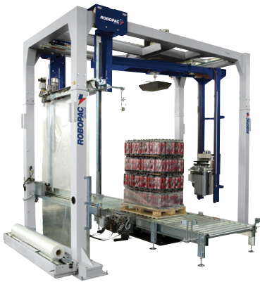
Robopac Helix 4