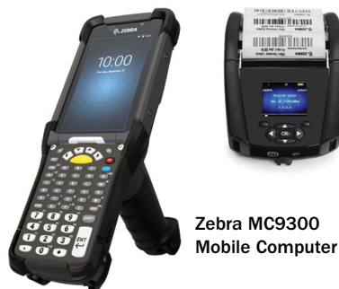
Zebra MC9300 Mobile Computer