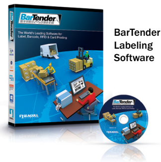
BarTender Labeling Software