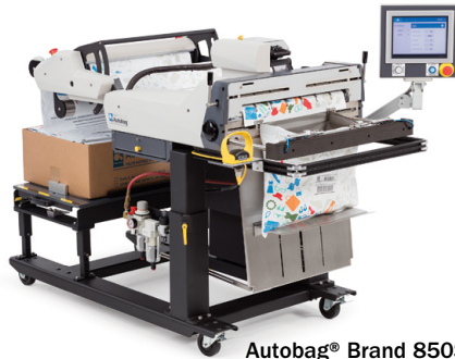
Autobag® Brand 850S™