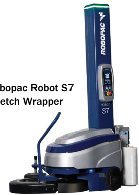
Robopac Robot S7 Stretch Wrapper