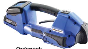
Orgapack OR-T 260

Ask our team of experts to help you take advantage of technology that will accelerate your operations and boost profitability.