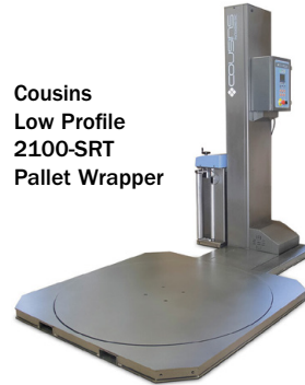
Cousins Low Profile 2100-SRT Pallet Wrapper