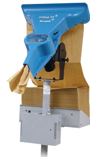
Ranpak Fillpak TT®