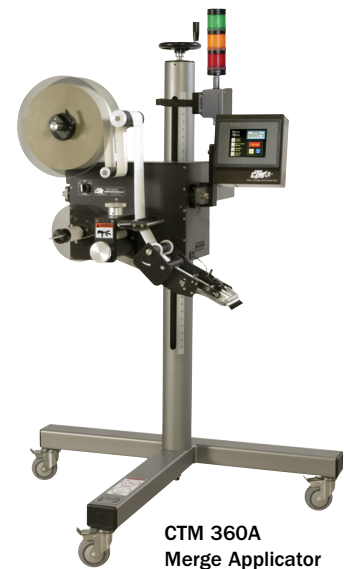
CTM 360A Merge Applicator