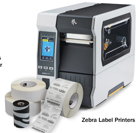
Zebra Label Printers