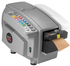
Better Pack 555eSA